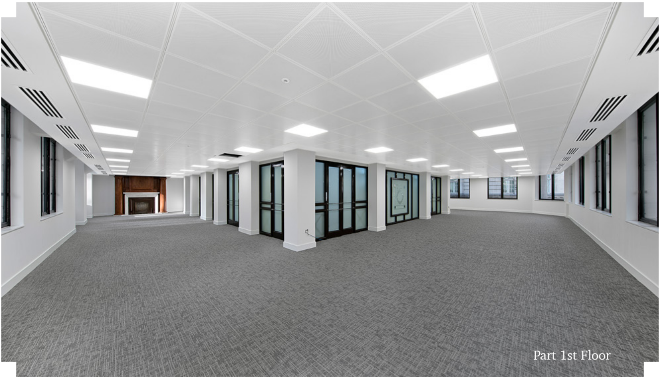
Part 1st Floor